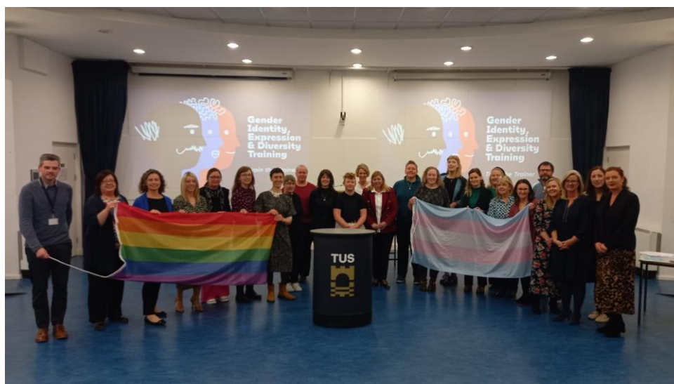
Gender Identity, Expression and Diversity Training of Trainers, TUS Thurles Campus

In addition to training sessions, partner HEIs and Shout Out launched a National Gender Diversity Champions Network with the purpose of providing further collaboration and support, to share best practice and for policy development in this area.