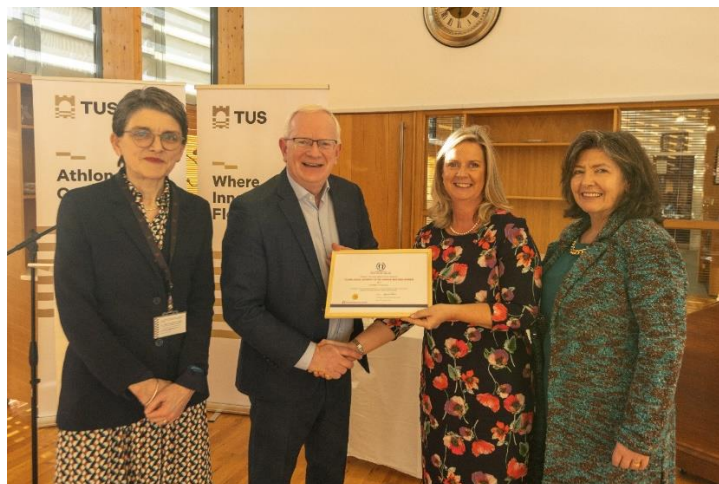
Receiving the University of Sanctuary Accreditation Award

TUS is currently supporting 29 students through its Sanctuary Scholarship programme. In 2023/24 TUS will establish its first Sanctuary Student Society and will roll out a mentorship programme for Sanctuary students which will connect Sanctuary students to relevant mentors tailored to meet their needs as they evolve over time from induction to graduation. TUS will also further embed intercultural and anti-racism training for staff and deepen engagements with local community groups working to support refugees and asylum seekers.